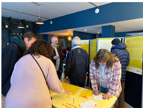
Gosport Waterfront Project

The Project Team are still processing all the feedback received, the next steps will be to share all the information collated with the architects that are designing the masterplan for the waterfront. GBC hope to be able to share more information on the specific proposals at a future engagement later this year .